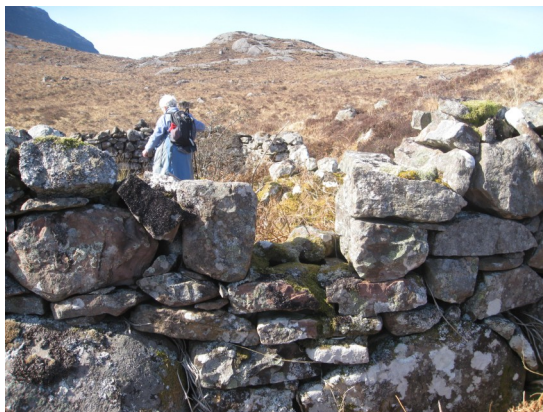
33 NG 84411 54240 35m house with garden and barn with old road running behind it.