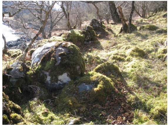
14 NG 84604 54811 4m older building with offset door