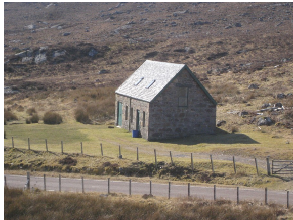
24 NG 84499 54414 23m ruined house/barn