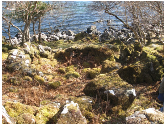
15 NG 84537 54802 25m platform