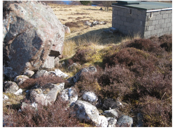
23 NG 84497 54355 25m deer larder