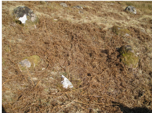
30 NG 84459 54316 30m building with rounded ends