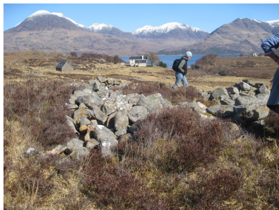
35 NG 84447 54128 33m byre dwelling