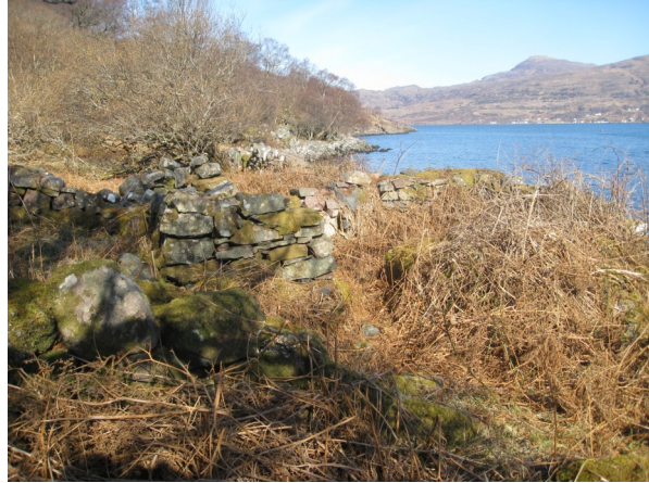
11 NG 84639 54761 1m jetty