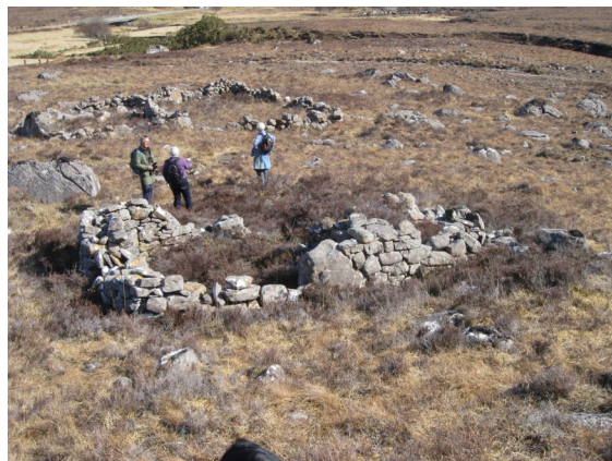
36 NG 84462 54133 29m fank