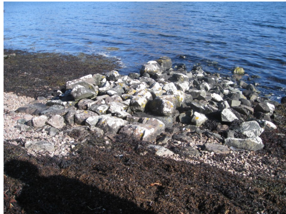
12 NG 84606 54782 3m wall and bothan