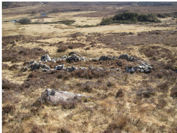
32 NG 84443 54291 30m building