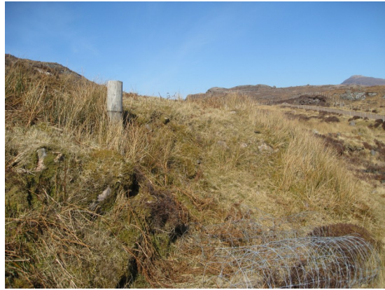
29 NG 84467 54319 28m footings of small building